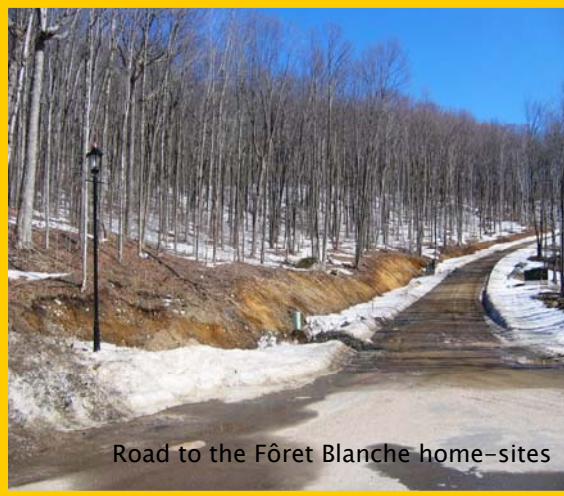
Road to the Fôret Blanche home-sites

Construction at neighbouring Étoile du Matin is nearing completion and closings will take place in early June.