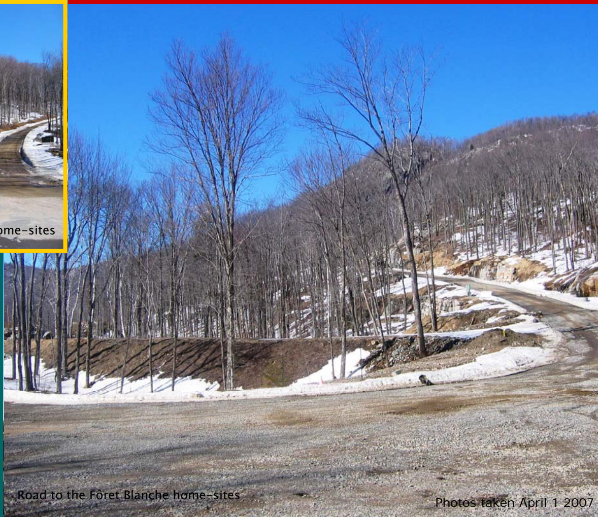
Road to the Fôret Blanche home-sites